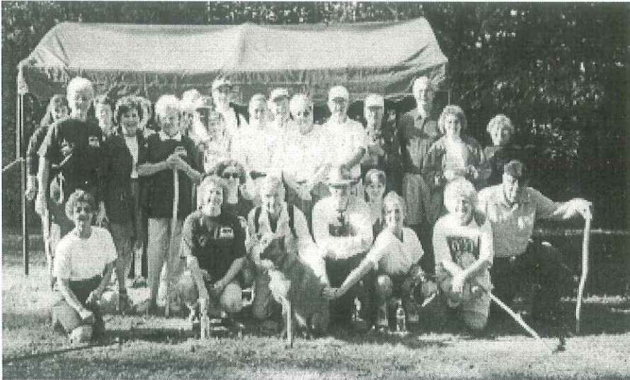
Participants in the 1998 Hike for Habitat at Indian Boundary Lake