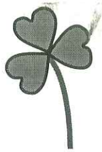
St. Patrick's Day March 17